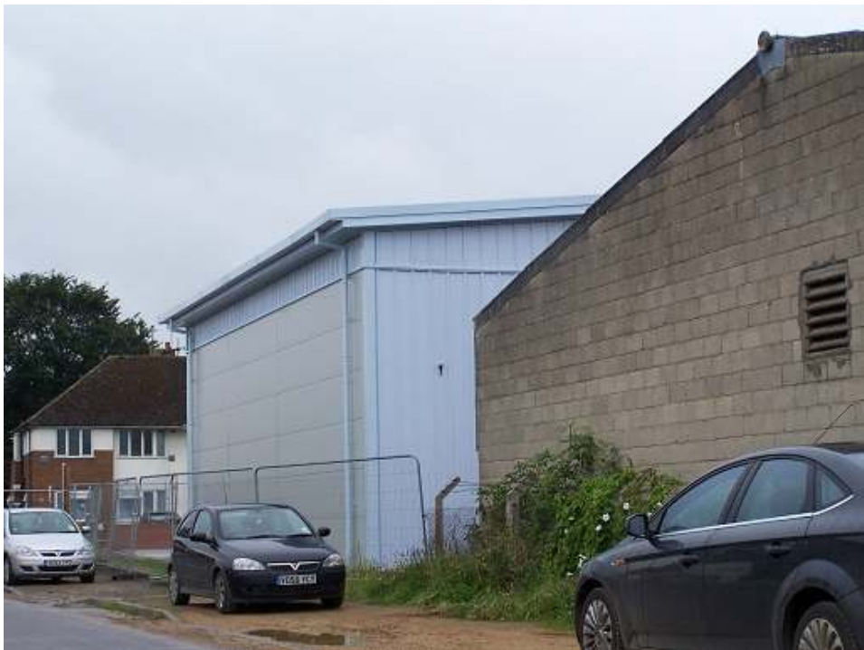
Figure 5.3 Recent Industrial Development in Faringdon – Cameo Glass

In the western Vale, the main centre of industrial land-use is at White Horse Business Park, Stanford-in-the-Vale that houses numerous small-occupiers engaged mainly in manufacturing. There are vacant premises and available development land at the park. Although agents generally stated that in line with long term trends of de-industrialisation in the UK demand for industrial sites and premises are not considered to be particularly strong there are two good examples of healthy demand for industrial style sheds in Faringdon. One is the redevelopment of an industrial site on Park Road at the Cameo Glass works (see Figure 5.3 below). The other is the redevelopment of a shed on Pioneer Road (see figure 5.4 below). This suggests that when the economic climate improves the lack of industrial supply in Faringdon may hinder demand.