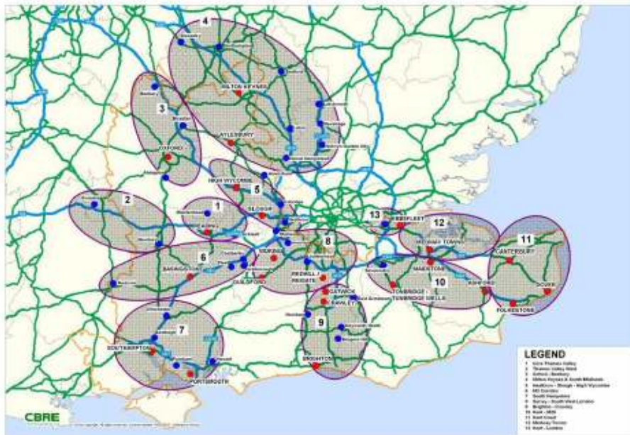
Figure 5-1 Classification of Key Property Market Groupings