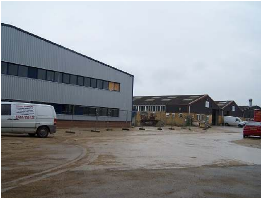
Figure 5.4 Recent Industrial Development in Faringdon – Pioneer Road