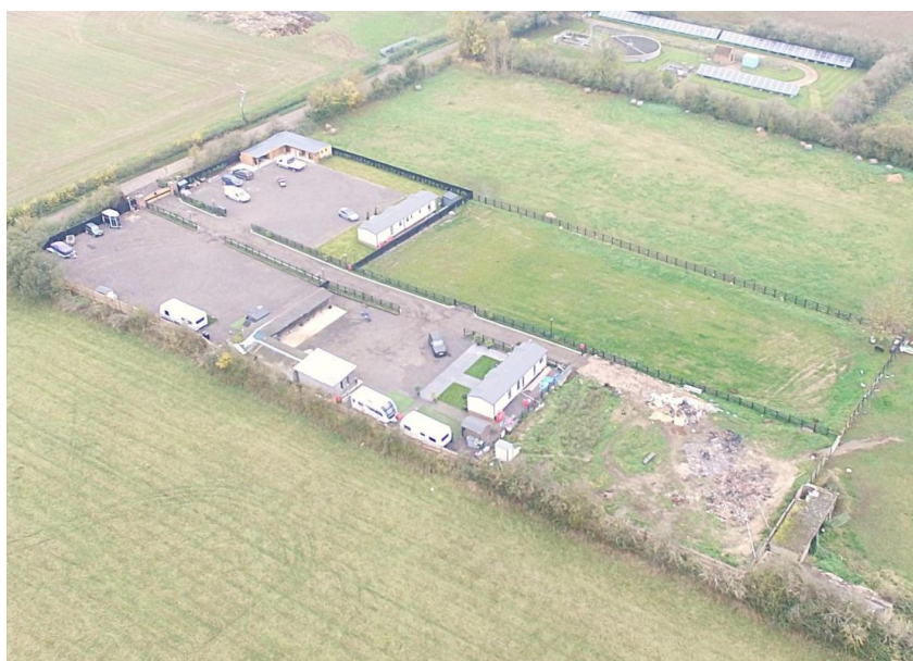
Drone Image No.2 – 7 November 2024