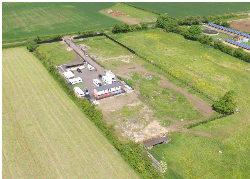
Drone Image No.1 – 5 June 2024

Image No.2 below shows the extent of the unauthorised development as it existed on 7 November 2024 1 .